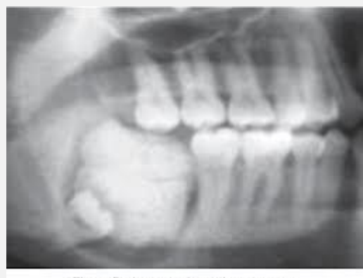
Fig. 3: Radiograph of complex adontome